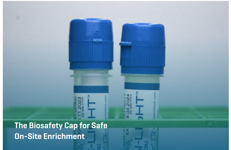
The Biosafety Cap for Safe On-Site Enrichment