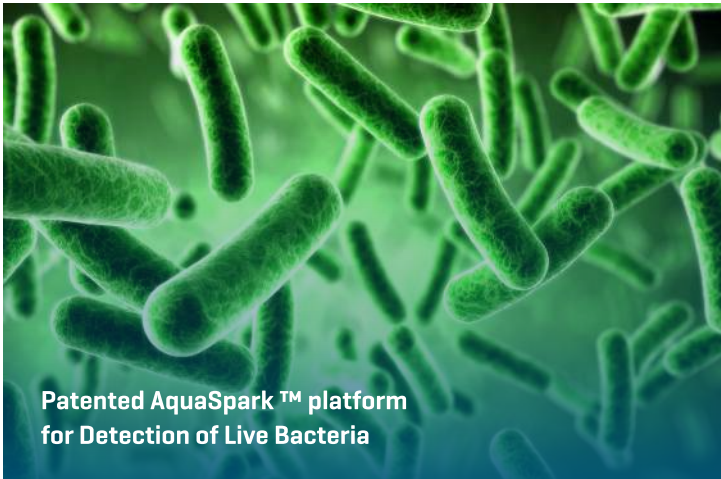
Patented AquaSpark™ platform for Detection of Live Bacteria